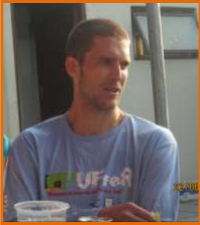
Later and looking better.